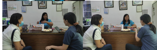
Meeting with RSMC Focal on IEC Materials, Distribution, MOA, requests on technical reports for landing data on site